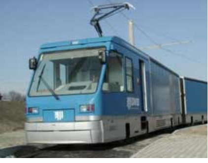
TRAM-FREIGHT EXAMPLES FROM DRESDEN, VIENNA AND ZURICH